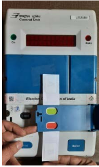
Fixing Green Paper Seal