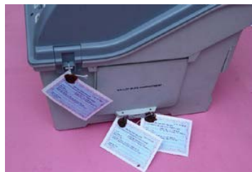
Sealing of Drop Box of VVPAT with Address Tag