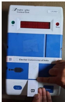
Affixing Green Paper Seal