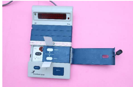
Sealing inner Result Section with Special Tag